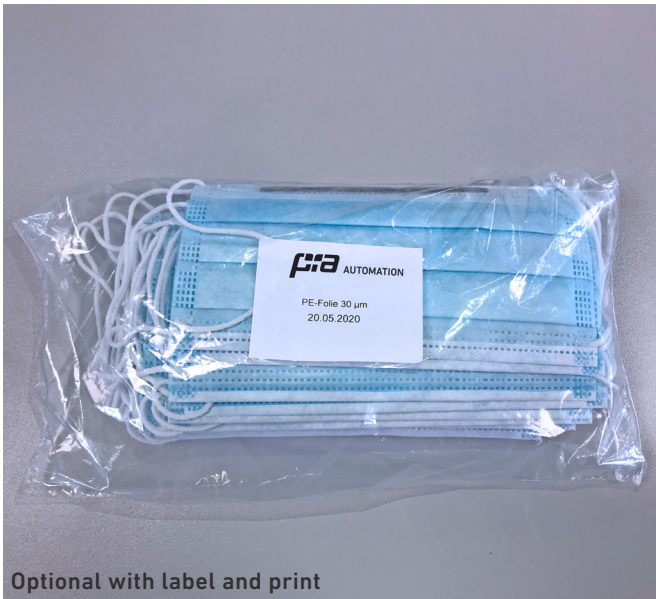
Optional with label and print