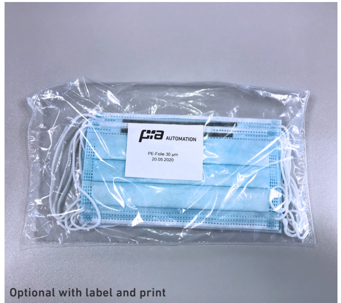
Optional with label and print